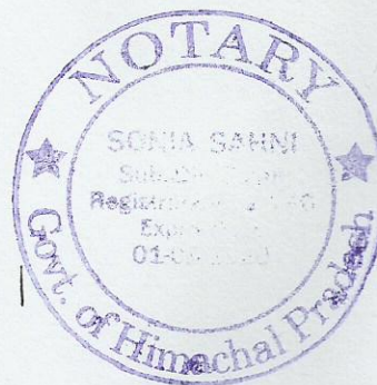
Photo Copy Attested

Director L.R. Group of Institutes Solan (H.P.)